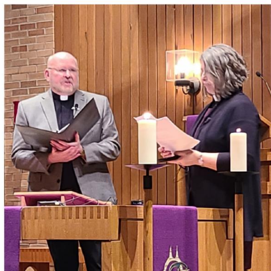
LSS Metro Benefit for Youth Lutheran Social Service (LSS) is having their annual Benefit for Youth that celebrates all