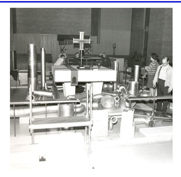
1968 Organ Assembly