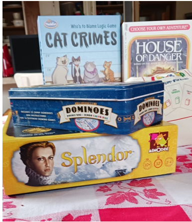
Table Top Board Game Meet Up

Join us on the first Friday of the month, from 1:30-5:00 pm for Table Top Board Game Meet Up.