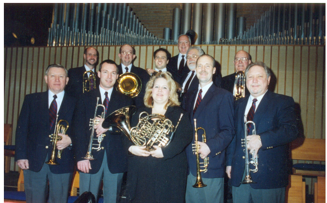
2003 HOP Brass