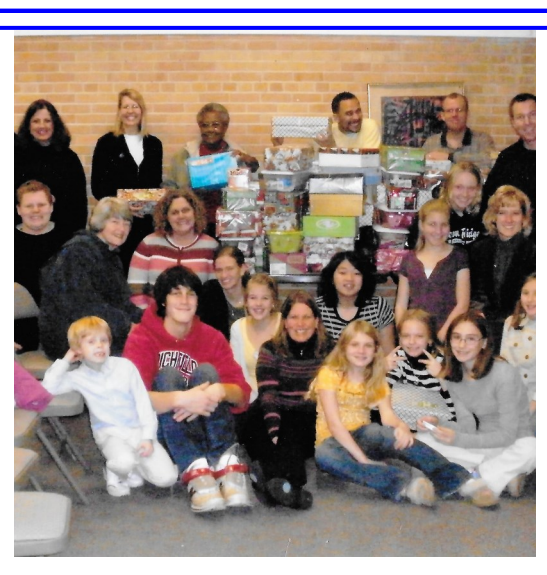
2008 Operation Christmas Child